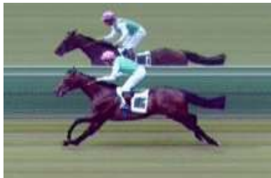
Art Master

Steering Art Master (Royal Academy) to an all-the-way success in Monday's G3 Prix de la Jonchere at Chantilly proved one of Gary Stevens' easiest tasks since taking up his retainer with Andre Fabre at the end of March. Always in complete control, Stevens