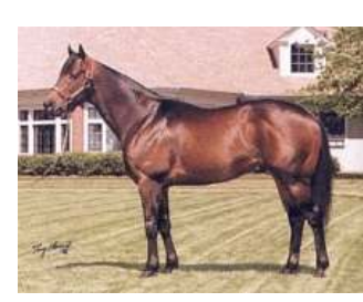
Roar has seven starters in Carreras de las Estrealla

A total of 76 Argentinian-bred horses in six divisions has been entered for this afternoon's Carreras de las Estrellas program, the equivalent of the Breeders' Cup, at the Hipodromo Palermo. Three Group 1 winners take