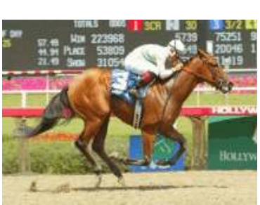
So True...

Chandtrue again was very impressive as he captured his second stakes tally with aplomb. The bay, from the first crop of freshman sire Yes It's True (by Is It True),