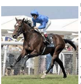
Doyen at Ascot

Godolphin had already covered the Royal meeting in