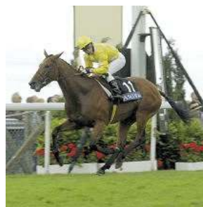
Mr Dinos in 2003

Mr Dinos (Ire) (Desert King {Ire}) will be treading familiar territory this afternoon as he bids to win a second renewal of the G1 Ascot Gold Cup at the Royal meeting. With an emphatic victory in his first attempt at this marathon last year, he has history on his side as no fewer than eight horses have won multiple Gold Cups since 1975. He had shaped like a stayer in his sophomore year when finishing runner-up in the G3 Queen's Vase over two miles at the 2002 Royal meeting, but found the extended 14 fur-