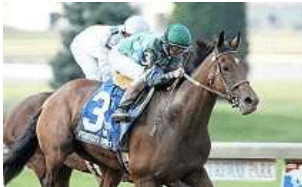
Perfect Drift