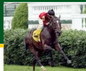
SISTER STAR