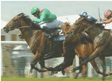
Azamour (green silks) wins the St James's Palace

He had hit the board in both the G1 2000 Guineas and G1 Irish 2000 Guineas, but the Aga Khan's Azamour (Ire) (Night Shift) turned the tables on his previous conquerors in a competitive renewal of the G1