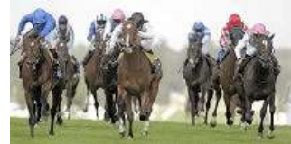
Refuse to Bend (blue cap)

Twelve months after Godolphin brought Dubai Destination back from the wilderness to win this, the Boys in Blue repeated the feat as Refuse to Bend (Ire) (Sadler's Wells) collected their sixth renewal of Royal Ascot's G1 Queen Anne S. since 1996.