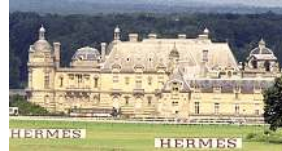
Chantilly