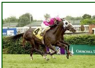
Four Footed Fotos

A # will distinguish first-time stakes-winners, a @ will indicate first-time graded stakes-winners, a ▲ will denote a first-time Grade/Group 1 winner, a + will first-time starters, an (S) will be used for state-bred races, a (C) will be used for maiden-claiming races and an (R) will be used for other restricted races. Purses for Canadian races are in Canadian dollars.