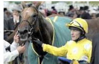
Mr Dinos