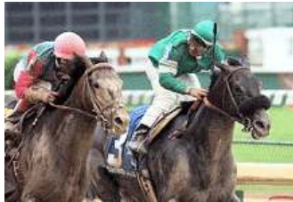
Colonial Colony (left) takes Foster