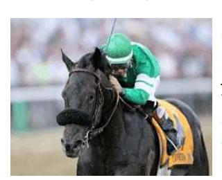
Southern Image Horsephotos

The last-minute addition of Best Minister (Deputy Minister) pushed Saturday's GI Stephen Foster H. field to six. Highweighted at 122 pounds is Californian im-