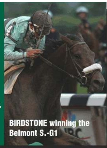
BIRDSTONE winning the Belmont S.-G1

Power. Passion. Performance. 859-293-2676