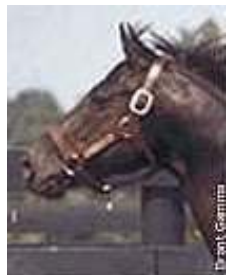
Clever Trick

Leading sire Clever Trick (Icecapade-Kankakee Miss, by Better Bee) was euthanized June 5 at Glencrest Farm after he suffered massive kidney failure. The 28-year-old stallion, who stood his entire stud career at Glencrest, was found on the ground Saturday, and after