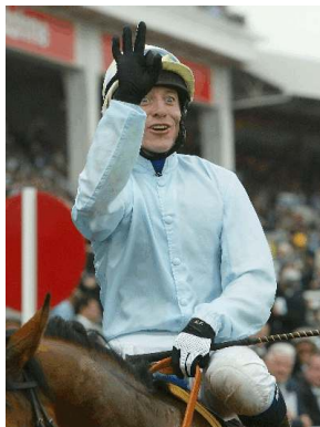
Kieren Fallon