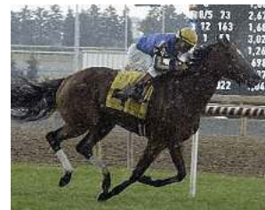
Inish Glora