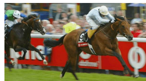
North Light