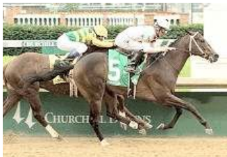
Lunarpal