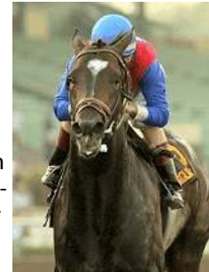
Medaglia d'Oro