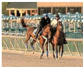
Feelin' Frisky...

After arriving from Pennsylvania to a hero's welcome at Belmont Park Wednesday, Smarty Jones (Elusive Quality) responded to all the brouhaha by...lying