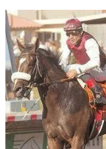
Tizdubai

Frankie Dettori in favor of Gonfilia . The latter was runner-up to the subsequent G1 Irish 1000 Guineas third Illustrious Miss in the G3 Chartwell S. at Lingfield May 8 before taking the Listed Conqueror S. at Goodwood 12 days later. Tizdubai , a full sister to Horse of the Year Tiznow , came up with a chip following her Sorrento score Aug. 9 and has not raced since. This will mark her first start on grass. "I like Tizdubai and she will be a good filly in the future," said trainer Saeed bin Suroor. "She is so honest in her work in the mornings. She has not run since last year and I believe she will need the race."