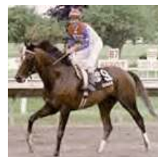
Two-time MassCap winner CIGAR

The 14-race MassCap Day undercard will also feature the $200,000 James B. Moseley Breeders' Cup H. for 3-year-olds & up, 6 furlongs