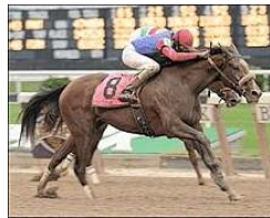
Society Selection