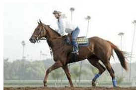
Victory U.S.A.