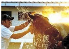
Smarty Jones

Shortly before he arrived via police escort to Belmont Park yesterday morning, Smarty Jones (Elusive Quality) drew the outside nine post position for his quest to