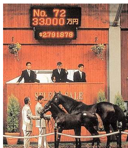
2003 Saletopper

316 foals have been catalogued for the annual Select Foal Sale, which will be held July 12 and 13 at Northern Horse Park in Hokkaido, Japan. And though there are no more offspring of Sunday Silence--who sired the saletopper in each of the last six years--the catalogue does boast a strong international group of sires, including Brian's Time, Dehere, Forestry, Forty Niner, French Deputy, Fusaichi Pegasus, Gone West, King's Best, Point Given, Rahy, Seeking the