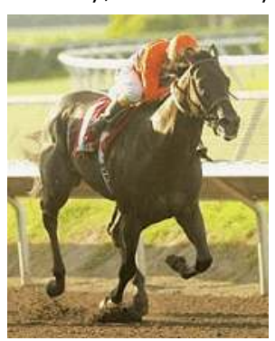
Siphonizer