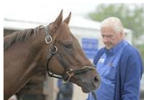
Smarty Jones