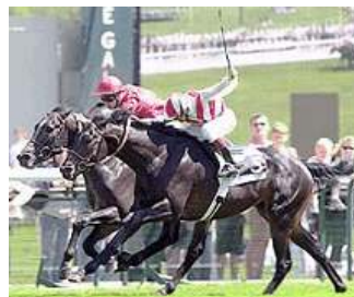
Millemix (rail) in the Prix Lupin