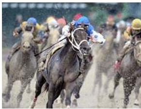
Smarty Jones