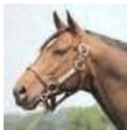
Champion & Leading Sire LANGFUHR

Lane's End salutes recent inductees to the Canadian Hall of Fame