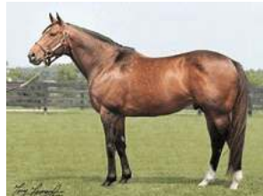
Langfuhr