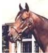
Champion CLASSY 'N SMART Dam of Leading Sire SMART STRIKE

Lane's End salutes recent inductees to the Canadian Hall of Fame