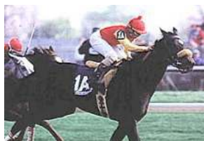
Dance Smartly