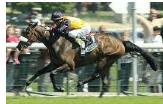
Torrestrella