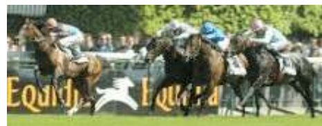
Antonius Pius hits the rail (American Post is 4th on the outside)

The history books will show that 2-5 favorite American Post (GB) (Bering {GB}) beat Diamond Green (Fr)