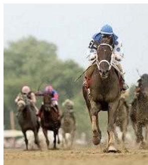
Smarty Jones