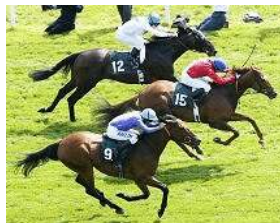
Russian Rhythm (center)

Classic heroine Russian Rhythm (Kingmambo) made a victorious return to the races by battling her way home to land the G1 Juddmonte Lockinge S. at Newbury yesterday afternoon. She is the first distaffer to win the race since Cormorant Wood (GB) shared the honors in 1984. "It's the first time she's beaten the colts and that's a big thing, but I always thought she was capable," said winning rider Kieren Fallon. "She was always going to get better as she got older since she's a lovely big, strong filly." Lockinge cont. p3