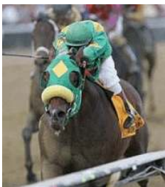
Gators N Bears Horsephotos