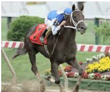
Smarty Jones