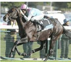
American Post

POST HASTE Khalid Abdullah has just one French Classic missing from his impressive resume, but American Post (GB) (Bering {GB}) can complete the picture in today's G1 Poule d'Essai des Poulains at Longchamp. It