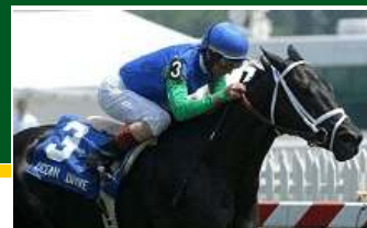
Graded winner Ocean Drive