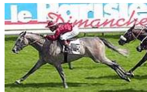
Grey Lilas

Gary Stevens has captured the public imagination in the short time he has been riding in France and Grey Lilas (Ire) (Danehill) would prove a fitting first domestic Classic winner in today's G1 Gainsborough Poule d'Essai des Pouliches at Longchamp. It was the imposing grey who opened the Hall of Famer's scoring in France when taking a hot course-and-distance conditions event Apr. 4. She was also the one to provide the Andre Fabre--