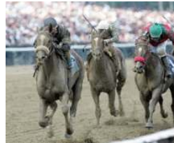
Royal Assault (left)

Unraced at two, Royal Assault kicked off his career with a 1 1/4-length victory going seven furlongs at Gulfstream Jan. 10 before finishing a well-beaten third to the talented Value Plus in an entry-level allowance test Feb. 14. Sent around two turns two starts back, the homebred ran on well to be second to subsequent GII Illinois Derby third Suave Mar. 13 and was most recently a respectable fifth, beaten 6 1/4 lengths, in the GI Wood Memorial Apr. 10. Allowed to settle in the rear of a well-bunched