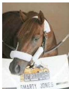
Smarty Jones

Kentucky Derby hero Smarty Jones (Elusive Quality) will break from post seven and try to keep his undefeated streak alive when he takes on up to 10 rivals in Saturday's GI Preakness S. at Pimlico Race Course.