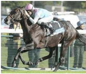
American Post

American Post (GB) (Bering {GB}) heads the eight colts left in the G1 Poule d'Essai des Poulains; he is one of only three domestic entries including the Lagardere Family's Diamond Green (Fr) (Green Desert), who was a promoted third behind American Post in the G3 Prix de Fontainebleau over course and distance last time Apr. 25. Aidan O'Brien has left in Antonius Pius (Danzig), who was disqualified from second in that contest, and is the most likely