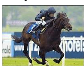
Yeats