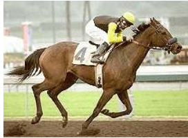
Victory Encounter

The GI Vanity H. at Hollywood Park was billed as a two-horse race between GI Breeders' Cup Distaff and GI Santa Margarita H. heroine Adoration (Honor Grades) and Star Parade (Arg) (Parade Marshal), winner of the