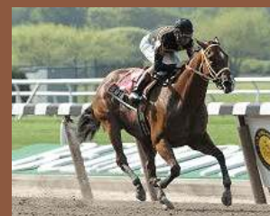
BEAR FAN wins Genuine Risk