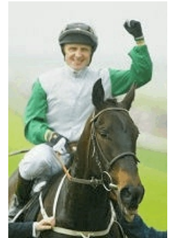
Attraction