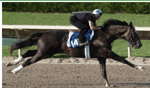
$3.1 Million Colt Sold at Calder