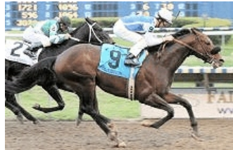
Olmodavor Benoit Photo

Total Impact (Chi) (Stuka) has been held winless since driving to a two-length tally in the 2003 edition of the GII Mervyn Leroy H., but the six-year-old looks ready to return to victorious form in this year's running of the 1 1/16-mile event at Hollywood Park this afternoon. The chestnut was sidelined after last year's Leroy