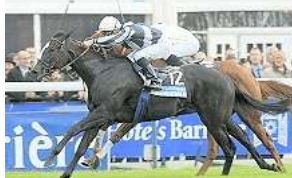
Denebola