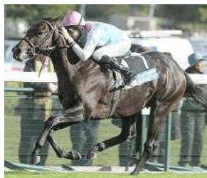
American Post