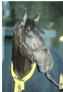
Rock Hard Ten

Rock Hard Ten (Kris S.) has been entered for today's GIII Derby Trial S. at Churchill Downs, but his connections are going to wait until the last minute before