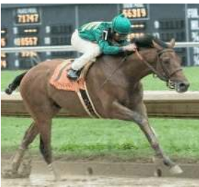
Midway Road

Ambassador W. S. Farish's Midway Road (Jade Hunter) turned in a tour-de-force in the GIII Ben Ali S. at