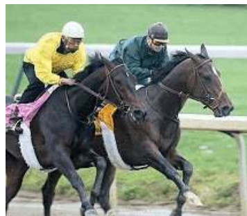
Action This Day (rail) & Halfbridled