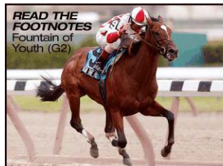
READ THE FOOTNOTES Fountain of Youth (G2)