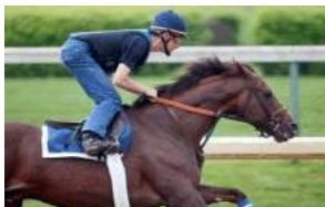
Master David