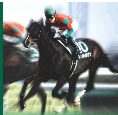
MEINER MORGEN , winner of the Lord Derby Challenge Trophy-G3 in Japan on 4/4/04.

GAINESWAY Power. Passion. Performance. 859-293-2676