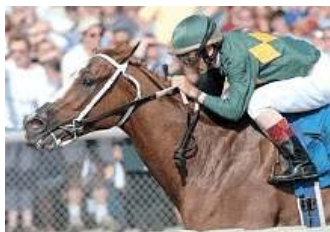
Quintons Gold Rush

Add Quintons Gold Rush (Wild Rush) to the list of Kentucky Derby contenders. The chestnut colt, 28th in graded earnings on the list of Derby hopefuls going into