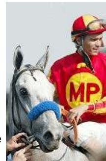
Preachinathebar