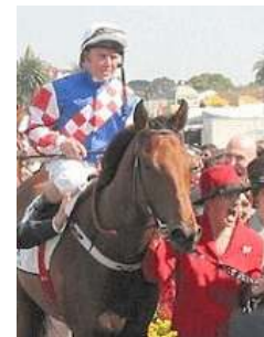
Dance Hero

Lonhro's fairytale farewell may have been an anti-climax, but all went to script here, with Dance Hero's win never in doubt. The colt concluded his juvenile season on a high note as only the fifth to complete Australia's two-year-old Triple Crown. But unlike former Triple victors Baguette (Aus) (1970), Luskin Star (Aus) (1977), Tierce (Aus) (1991) and Burst (Aus) (1992), Dance Hero had to run on three consecutive Saturdays to complete his task, taking the Apr. 3 G1 Golden Slipper, Apr. 10 G1 AJC Sires' Produce S. and yesterday's G1 Champagne S. over progressively longer trips. The professional gelding led from start to finish and was clocked in 1:34.75 to smash the 28-year-old race record by :0.45. Dance Hero now has six wins from seven starts and a record $3,156,940 prizemoney. Trainer Gai Waterhouse made a bold assessment of her game youngster after the race. "I wonder if he's going to be a horse as good as Kingston Town, because he's got the most brilliant speed," she said. "He doesn't care if he's over 1000 meters or over a mile, he just runs those brilliant times. I know he's only a two-year-old, but what else can you ask him to do? He's backed up three times in two weeks and he's just shown them a clean pair of heels." Stablemate Wager again chased Dance Hero home.