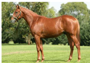
Lot 373