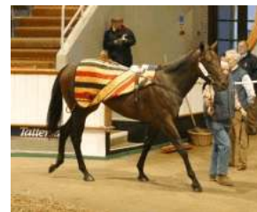
Tatts Topper Hip 156