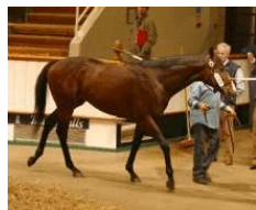
Hip 169 tattersalls.com

Kip Elser's Kirkwood Stables enjoyed a good touch when Step Lightly (Swain {Ire}), a $43,000 Keeneland September yearling, made 190,000gns when agent Noriyuki Arakawa, acting on behalf of Toyo Club of