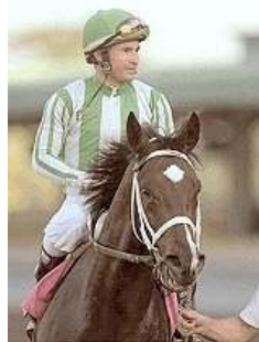
Johar

JOHAR TO MILL RIDGE Jayeff B Stables has purchased recently retired Breeders' Cup hero Johar (Gone West--Windsharp, by Lear Fan) and will stand the bay at Mill Ridge Farm near Lexington, Kentucky. The five-year-old, retired in March after sustaining a suspensory injury, is scheduled to arrive at Mill Ridge tomorrow, but will not cover mares until 2005. A stud fee will be set later this year. Bred by The Thoroughbred Corp., Johar was the first foal from the champion mare Windsharp and was born and raised