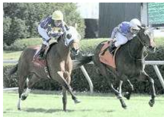
Lucifer's Stone (blinkers)

Lucifer's Stone had to summon all of her class to earn her third straight victory. An allowance winner at Gulfstream Jan. 14, the bay became a graded stakes winner in the GIII