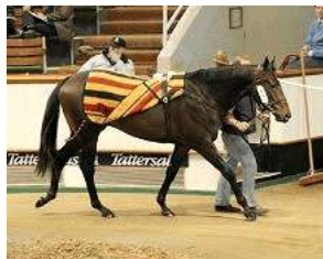
Lot 49 Fusaichi Pegasus Colt