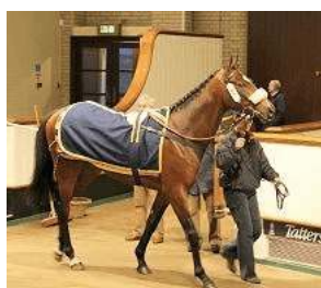
Lot 66