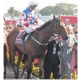
Dance Hero