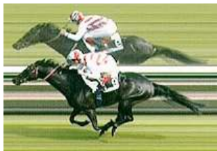
Voix du Nord