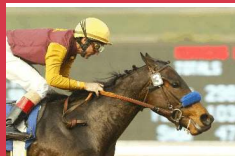
May Sale Graduate Yearly Report (G2)

THIS COMPLIMENTARY SERVICE IS AVAILABLE TO EVERY SUBSCRIBER (FAX AND EMAIL).