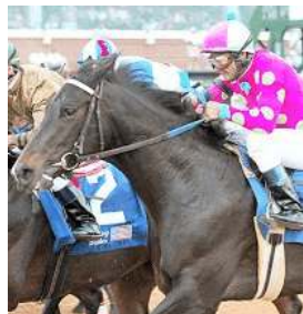
House of Fortune

The 17-length winner of the Mar. 6 California Oaks in her most recent appearance, House of Fortune made it two impressive efforts in a row to earn her first graded triumph.