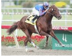
Lion Heart