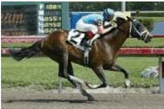
Purge winning at Gulfstream