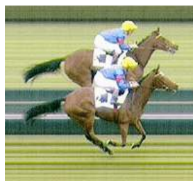
Ask for the Moon