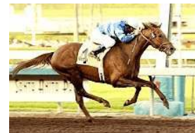
Master David