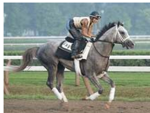
Value Plus

Value Plus (Unbridled's Song) has yet to win around two turns, but he acquitted himself admirably in the GI Florida Derby, his first try at nine furlongs and he will be well backed to get the job done in today's GI Wood Memorial at Aqueduct. "When you watch him train, he