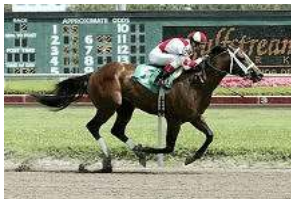
Forest Danger

Abbondanza was a sharp 5 3/4-length winner at first asking over the Big A inner strip, then ran fifth behind Redskin Warrior in the Best Turn S. after ducking in at the start. Most recently a wire-to-wire allowance victor at Laurel Mar. 20, the chestnut colt appears to be the fastest of the bunch here. A perfect two-for-two thus far, the Todd Pletcher-trained Forest Danger faces his biggest challenge yet. The $900,000 FTFEB juvenile was last seen notching a seven-furlong Gulfstream allowance Mar. 13. Shipping in from Southern California, Last Minute Detail cuts back in distance off his fifth-place showing in the GII San Felipe S. Mar. 14.