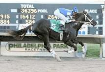
Smarty Jones

Unbeaten Smarty Jones (Elusive Quality) is the headliner at Hot Springs in the Arkansas Derby. The 7-5 morning-line favorite has drawn the outside in his quest to gain graded stakes earnings. "I