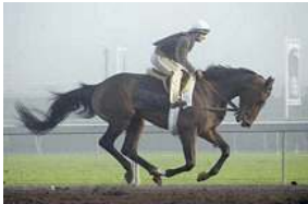
Action This Day Horsephotos

Two of Saturday's three major Kentucky Derby prep races --the $750,000 GI Toyota Blue Grass S. and the $1-million GII Arkansas Derby--attracted deep fields