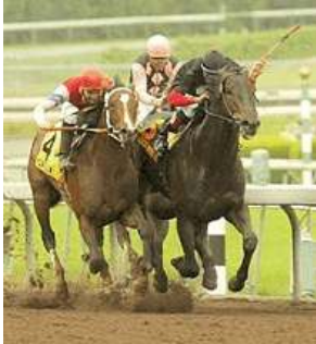
Castledale (red cap)

Making his second start on the main track, the 30-1 Castledale (Ire) (Peintre Celebre) overcame Rock Hard Ten (Kris S.) in the final strides to land the $750,000 GI Santa Anita Derby yesterday afternoon. The bay had drifted in slightly during the stretch run, causing Rock Hard Ten to move towards the rail, which in turn forced Imperialism (Langfuhr) to take up. After looking at the replay for several minutes, the stewards disqualified