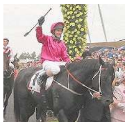
Lonhro

Lonhro was greeted by a sea of cerise at Rosehill yesterday as 32,000 racegoers, wearing pink caps and badges and clapping rhythmically, awaited the 11-time Group 1 winner when he returned to scale after his fifth