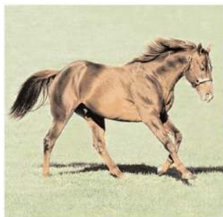
$7,500 Live Foal