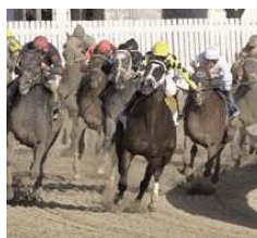
Pollard's Vision

Margins: 2 3/4, 2 3/4, 8HF. Odds: 1.70, 3.40, 4.50. Also Ran: O. K. Mikie , Skipaslew , Kilgowan , Pure American , Dancefortyniner , Chrome Soldier , Farnum Alley , White Mountain Boy .