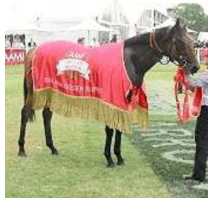
Dance Hero