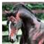
In the Wings (1986-2004)