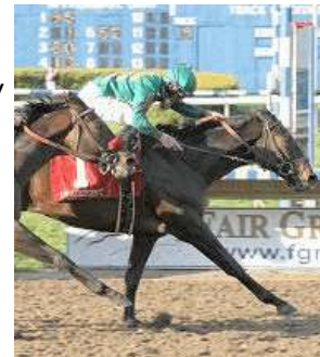
Gradepoint