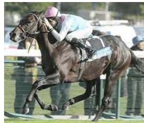
American Post