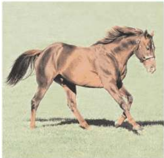
$7,500 Live Foal

The brisnet.com 'Race of the Day' is the 9th Race, $44,000 Alw, at Aqueduct. For pps and a complete race analysis, click here .