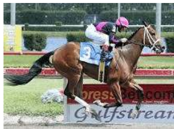
Madcap Escapade

The undefeated filly Madcap Escapade (Hennessy) heads a list of 15 late nominees to this year's Visa Triple Crown races. The late additions, made by the Mar. 27 deadline at a fee of $6,000, bring the total number of 2004 nominees to 449. Madcap Escapade, three-for-three in her career, most recently won Gulfstream Park's GII Forward Gal S. Mar. 13. A total of 10 fillies, including champion Halfbridled (Unbridled) and Breeders' Cup Juvenile