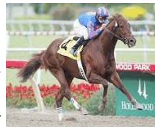
Lion Heart