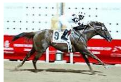
Our New Recruit