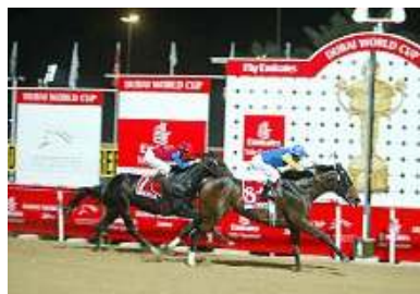
Pleasantly Perfect outgames Medaglia d'Oro

The California conditioner would finish second and third the following year and sent out the runner-up in 1999. But yesterday, the Hall of Fame trainer got the monkey off his back, as defending Breeders' Cup Classic champ Pleasantly Perfect (Pleasant Colony) turned back an extremely game