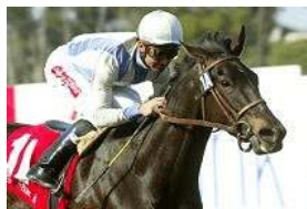
Dublino

Sunday's second race, a money allowance at one mile on the turf, features a stellar five-horse field. The Grade I winner Dublino (Lear Fan) makes her 2004 debut, as do French stakes winner Intercontinental (GB) (Danehill) and U.S. graded stakes winner Noches de Rosa (Chi) (Stagecraft {GB}).