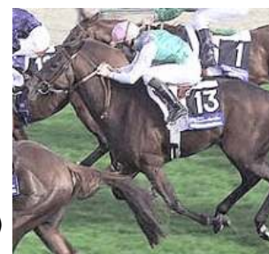
Intercontinental