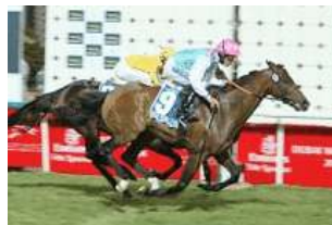
Polish Summer