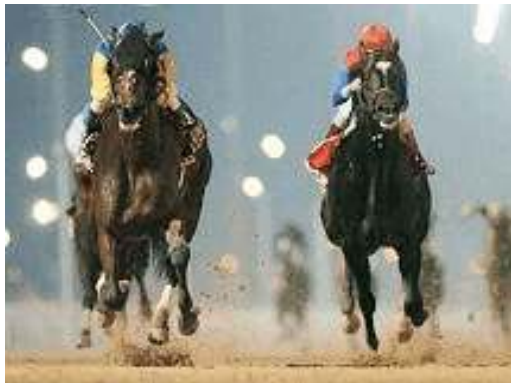
Pleasantly Perfect (left) and Medaglia d'Oro storm down the Nad Al Sheba stretch