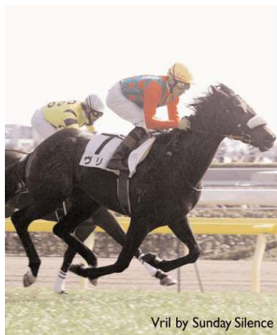
Vril by Sunday Silence