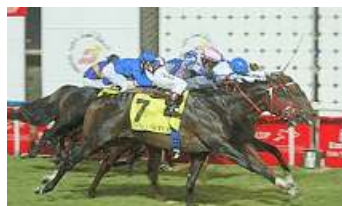
Right Approach (red bridle) & Paolini DRC/Andrew Watkins

A camera couldn't separate Paolini (Ger) (Lando {Ger}) and Right Approach (GB) (Machiavellian), resulting in a dead heat in the $2-million G1 Dubai Duty Free,