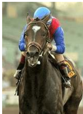
Medaglia d'Oro Benoit

California-based runners likely to battle for favoritism in the jewel in the crown of the world's richest race day, the $6-million G1 Dubai World Cup. While post positions for the World Cup will be drawn Wednesday morning, 12 horses, headed by 2003 Breeders' Cup Classic winner Pleasantly Perfect (Pleasant Colony) and runner-up Medaglia d'Oro (El Prado {Ire}), were declared for the 2000-