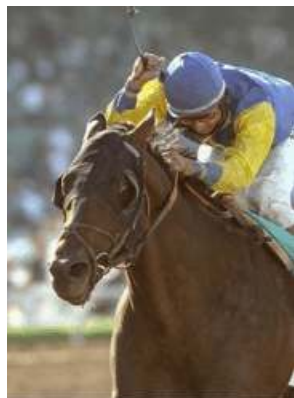
Pleasantly Perfect Benoit

An international cast of 66 Thoroughbreds was entered yesterday for Saturday's $15-million Dubai World Cup card at Nad al Sheba, with a pair of Southern