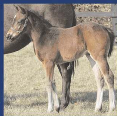
Colt ex BELIKE THE WIND