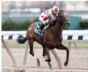
Read the Footnotes