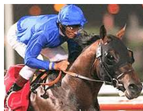
Rosencrans

Godolphin saddle their first runner in Britain in 2004 in the shape of the smart Rosencrans in this competitive contest. He has already finished third in the G3 UAE 2000 Guineas on dirt at Nad al Sheba Feb. 5 before taking the Skywards S. over 7½ furlongs back at that track last time Feb. 28. "Rosencrans travelled very well to England and he did his main work for the race in Dubai before he set off," trainer Saeed bin Suroor said. "He's ready to run and I am happy with him. We will see how he does on his first run on the all-weather surface--I believe he can run a big race. He improved a lot from his first race of the year and won very easily last time. We have decided to race him in England--this is our first runner in March--and then plan the future." He faces stiff opposition in last year's G2 Gimcrack S. runner-up Fokine , who has been off the track since finishing seventh in the G1 Middle Park S. at Newmarket in October.