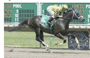
Deputy Storm