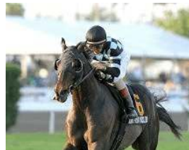
Man From Wicklow

likely favorite in the race, Request for Parole has really found himself in his last three outings, recording triple-digit Beyers in each, including a victory in the GIII Mac Diarmida H. and a fourth-place finish in the GI Gulfstream Park Breeders' Cup H. last out Feb. 22. Man From