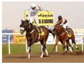
Conflict A Watkins

Conflict is expected to make a quick reappearance in the Mar. 27 G2 Godolphin Mile at Nad al Sheba.