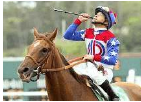
Azeri and Mike Smith

A NEW RIDER FOR AZERI? Jockey Mike Smith has been aboard champion Azeri (Jade Hunter) in all 16 of her career starts, but he may not have the mount when the six-year-old mare makes her 2004 debut. Azeri is pointing for the Apr. 3 GI Apple Blossom H. at Oaklawn Park, but new trainer D. Wayne Lukas said yesterday, "We haven't named any rider [for the Apple Blossom]. No decision has been made, but I don't think I'll have any trouble getting a rider for her." If he is offered the ride, Smith could have a decision to make. He is currently booked on Lion Heart in the GI Santa Anita Derby on the same day as the Apple Blossom. Azeri is on schedule for a trip to Oaklawn after working seven furlongs in 1:24 3/5 at Santa Anita yesterday.