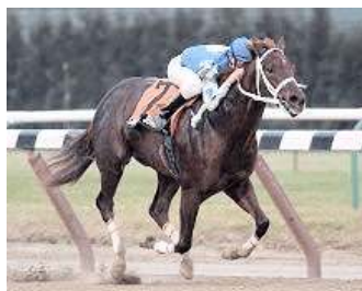
Smarty Jones