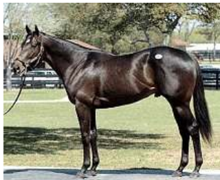
Hip 317 Horse photos