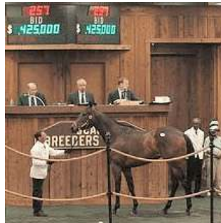
Hip 257 Horse photos