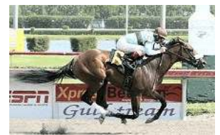
Birdstone and Bailey

Eight years ago, Hall of Fame jockey Jerry Bailey willed the late-closing Grindstone past Cavonnier to win the 122nd Kentucky Derby by a nose. This year, Grindstone's son Birdstone, a half brother to Eclipse winner Bird Town, looks to emulate his sire in the 130th Run for the Roses. Bailey picked up the mount on the Nick Zito trainee following his second career start, in which he ran fourth in the GI Hopeful S. last summer. Bailey promptly booted home Birdstone to a 2 1/2-length win in the GI Champagne S. and was again aboard when the colt, returning from a four-month break, won a Gulfstream allowance race by three lengths on Valentine's Day.