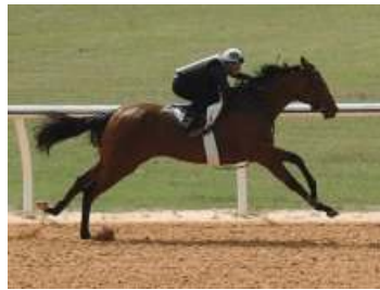
Hip 54

A filly from the first crop of GI Met Mile winner Yankee Victor (Saint Ballado) attracted a final bid of $575,000 from Narvick International to top yesterday's opening session of the Ocala Breeders' Sales Company's Selected Two-Year-Olds in Training Sale in Florida. The six-figure price tag is the highest ever for a two-year-old filly at OBS.