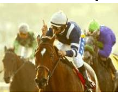
and 1:11.07, while Adora- Adoration

(Parade Marshal) home in both the GII Bayakoa H. last December, where she was second, and the Feb. 16 GI Santa Maria, where she tired to fourth. The Argentinian mare once again set the pace yesterday through easy fractions of :23.20, :46.76