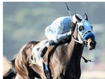
Silent Sighs

A battle of the unbeatens loomed in yesterday's GI Santa Anita Oaks between Eclipse Award winner Halfbridled (Unbridled) and A.P. Adventure (A.P. Indy), but it was the less accomplished Silent Sighs (Benchmark) who played spoiler,