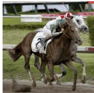
Friends Lake (outside) wins in Florida

Funny Cide became the first New York-bred horse to win the Kentucky Derby with his stirring victory last year. Could Empire-breds make it two in a row? They