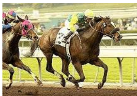
A.P. Adventure defeating Hollywood Story