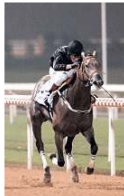
Tamarillo

Second in her first two career outings in England, Tamarillo broke her maiden at Nottingham third time out Aug. 20 before rounding out her juvenile campaign with a fifth in the G2 May Hill S. at Doncaster Sept. 11. The grey filly made two starts at Nad al Sheba in February, finishing fifth to the highly regarded Catstar in the UAE 1000 Guineas Feb. 7 before being a neck runner-up to colts in a Feb. 21 conditions race. Allowed to settle into stride in the early stages here, Tamarillo overhauled