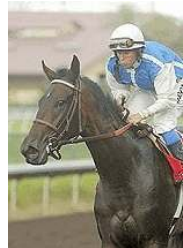
Halfbridled

Last year's champion two-year-old filly Halfbridled (Unbridled) will make her long-awaited comeback in the GI Santa Anita Oaks Saturday. The big filly has drawn the rail in a deep renewal of the