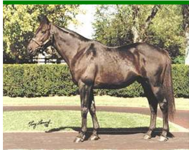
By Roberto, out of Andover Way, by His Majesty