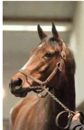
Cat Fighter