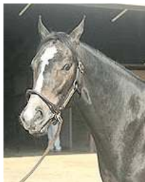
Hip 84