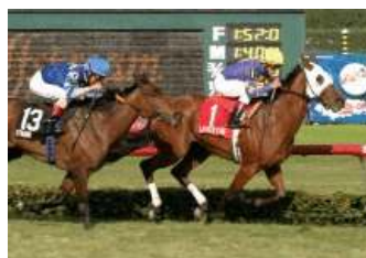
Lucifer's Stone (blinkers) defeats Dynamia

Team Solaris Stable's Lucifer's Stone (Horse Chestnut {SAf}) charged through what jockey Jose Santos called "half a hole" to defeat favored Dynamia