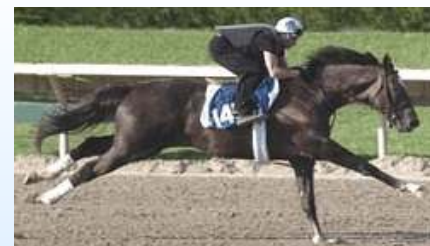
Hip 145 breezes in :10 2/5

by Yes It's True--Don't Be Blue Purchased as a yearling at Fasig-Tipton Kentucky July for $155,000