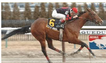
Redskin Warrior winning Best Turn S.

3YO colt REDSKIN WARRIOR by INDIAN CHARLIE romped in the Best Turn S. at Aqueduct Saturday, winning by 5 lengths for his 3rd straight victory! He won in 1:09 4/5 – the fastest 6 furlongs of the meet.