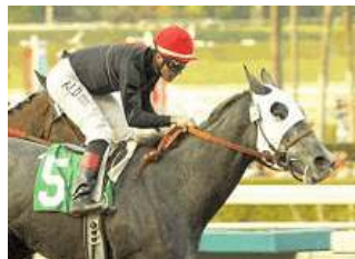
Island Fashion