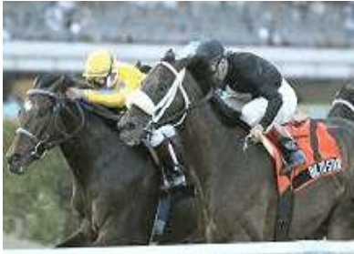
Hard Buck (outside) overtakes Balto Star

Hard Buck (Brz) (Spend a Buck), a Group 1 winner in his native Brazil, kicked off his North American campaign with three straight wins last fall and got back on the winning track with a late-charging victory in yesterday's GI Gulfstream Park Breeders' Cup H. The five-year-old came to the U.S. last year after a ninth-place showing in the G2 UAE Derby at Nad al Sheba in March and culminated his three-race win streak with a half-length tally in the Nov. 16 GIII River City H. The bay suffered his first North American loss when fourth in the off-the-turf GIII Canadian Turf H. and he was dismissed at 11-1 in yesterday's 1 3/8-mile event. As favored Balto Star (Glitterman) led the field through a mile in 1:36.23, Hard Buck tracked the pacesetter in fourth. He loomed three wide on the final turn and finished determinedly to just nail Balto Star on the wire. Cont. p. 2