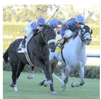
Request for Parole

A solid field of eight runners, headed by Grade I winner Balto Star (Glitterman) and defending champion Man From Wicklow (Turkoman), will go postward in this afternoon's GI Gulfstream Park Breeders' Cup H.,