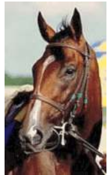
Summer Squall

Summer Squall (Storm Bird--Weekend Surprise, by Secretariat) has been pensioned from stud duty at Lane's End Farm due to continuing fertility problems. Running in the colors of Dogwood Stable, the $300,000 KEEJUL yearling purchase reeled off four straight wins, including the 1989 GII Saratoga Special during his juvenile season before earning his first Grade I score in Saratoga's marquee event for two-year-olds in that race. A hairline fracture, sustained in the Hopeful, forced the colt to the sidelines for the rest of the year, but he would return the following term and pick up where he left off. A winner of four of seven starts as a sophomore, including the GII BlueGrass S., Jim Beam S. and GII Pennsylvania Derby, Summer Squall recorded his biggest score in the 1990 GI Preakness S. over Unbridled, who had beaten the colt two weeks prior in the Kentucky Derby. He finished first or second in 17 of 20 lifetime starts, with 13 victories and earnings of $1,844,282. The 17-year-old stallion began his stud career at Lane's End in 1992 and has sired 31 stakes winners, including champions Charismatic and Storm Song. He has also been represented by graded stakes winners Summer Colony, Globalize, Postponed, Golden Gale and Delay of Game. From 10 crops of racing age, Summer Squall is the sire of 208 winners from 264 starters with lifetime earnings of $27,794,807.