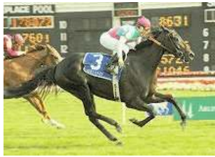
Heat Haze

Juddmonte Farms' Heat Haze (GB) (Green Desert--Hasili {Ire}, by Kahyasi {Ire}), an Eclipse Award finalist for champion turf mare, has been retired due to an ankle injury, according to Daily Racing Form . The five-year-old will be bred this season to another Juddmonte Eclipse finalist, Empire Maker. "She had a puffy ankle," trainer Bobby Frankel told DRF . "I thought about it and decided not to waste a year. I weighed the pros and the negatives. The only thing that could help her this year was if she won the championship." A Listed winner in France when trained by Andre Fabre,